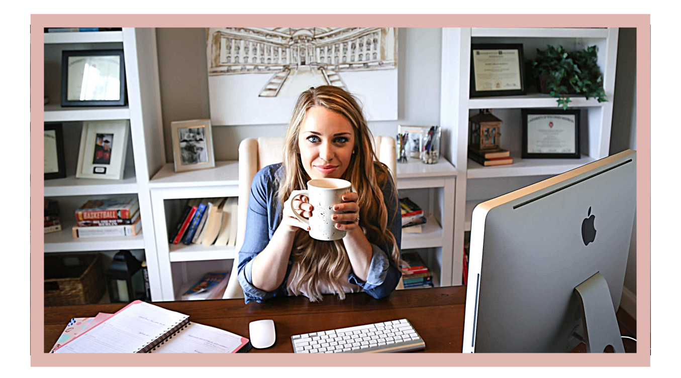
SO VERY MUCH FOR YOUR INTEREST! I AM MOST EXCITED TO WORK TOGETHER!